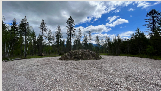
New additional parking area @ lower lot