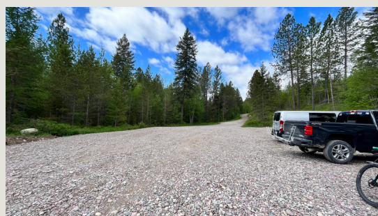
Previous parking area @ lower lot