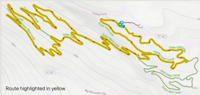
Route highlighted in yellow